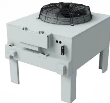
NetCol500-A060 (Outdoor unit)