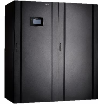
NetCol8000-A (Indoor unit)

NetCol8000-A is the in-room air cooled smart cooling solution consisting of indoor and outdoor unit. It is flexible for expansion, matching heat load intelligently. NetCol8000-A uses unique algorithm construct a precision management and intelligent O&M system, building an efficient, reliable and simple data center.