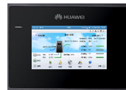
7 inch LCD true color touch screen