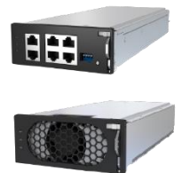
Hot swappable controller and power module